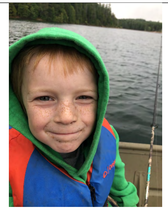
Figure 8. Fishing Derby - Cuttest Fisherperson Runner Up