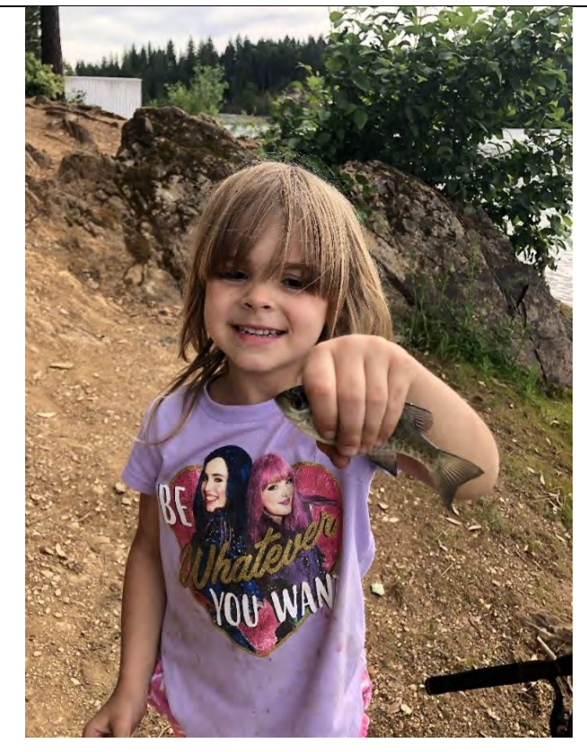
Figure 4. Fishing Derby - Smallest Minnow Winner