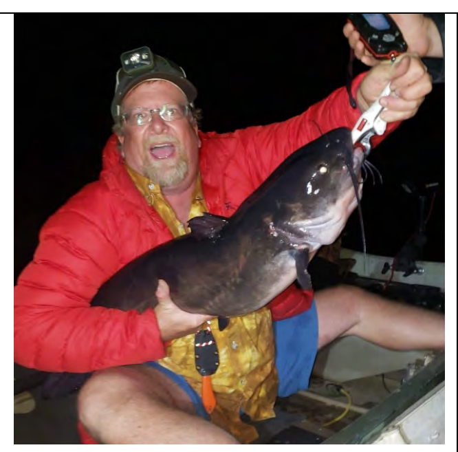
Figure 1. Fishing Derby – Biggest Fish Finalist