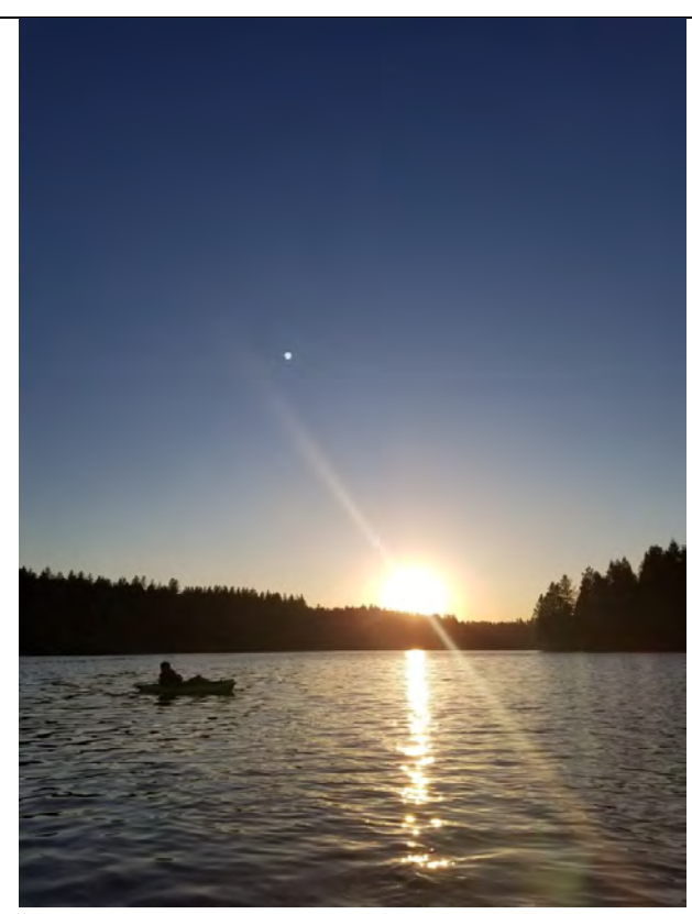
Figure 7. Fishing Derby - Best Photo Finish Runner Up