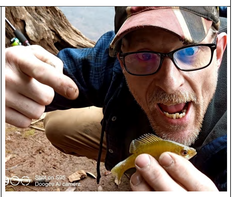
Figure 6. Fishing Derby - Smallest Minnow Runner Up