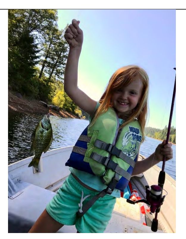
Figure 5. Fishing Derby - Prettiest Fish