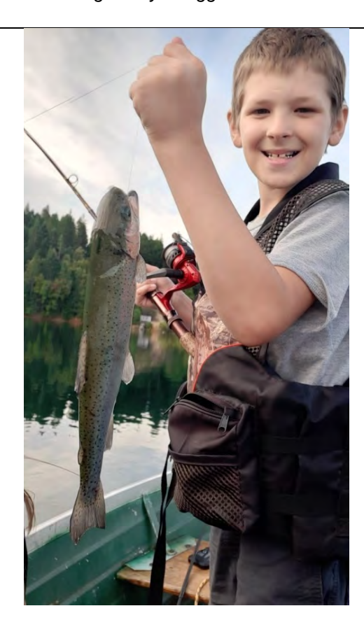
Figure 3. Fishing Derby - Biggest Fish Contender