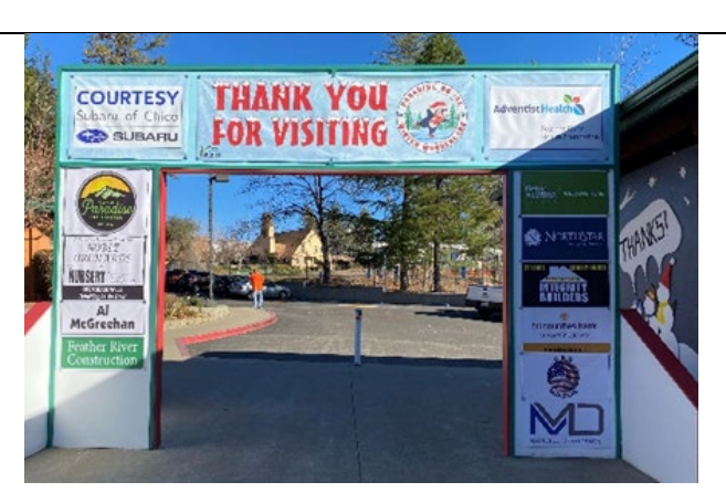
Figure 3. The new entry way built by Feather River Construction, Ed Gleason.