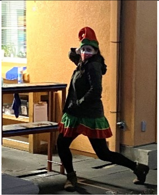
Figure 11. The Yule Logs perform to a packed Rink