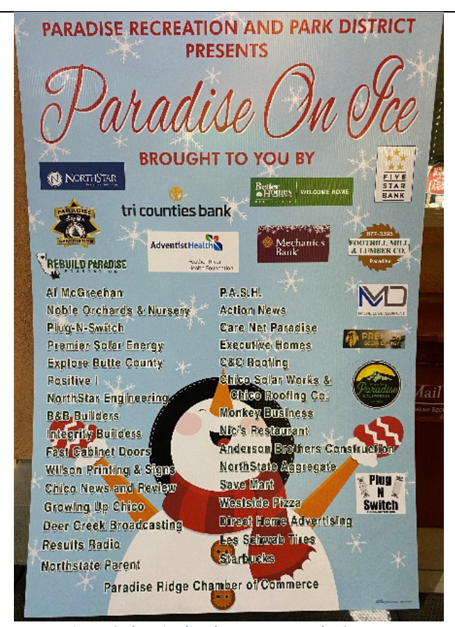
Figure 9 The Nice list that represents the Sponsors