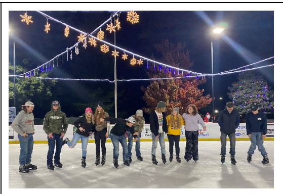
Figure 2. The first Teen Skate Night of the Season