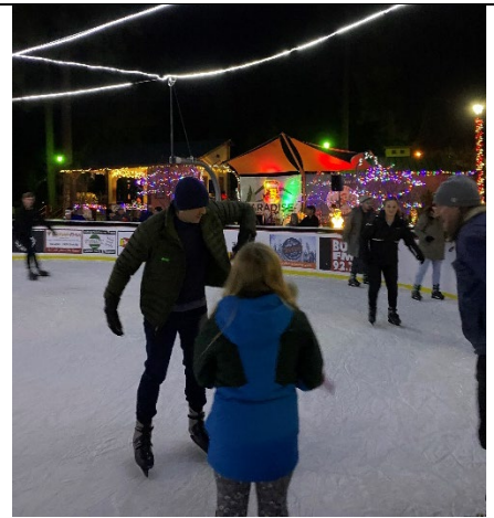
Figure 4. Skaters enjoying a night of live music and skating