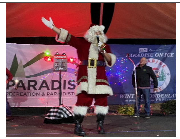
Figure 5 Santa's Arrival on Dec. 4th, 2022