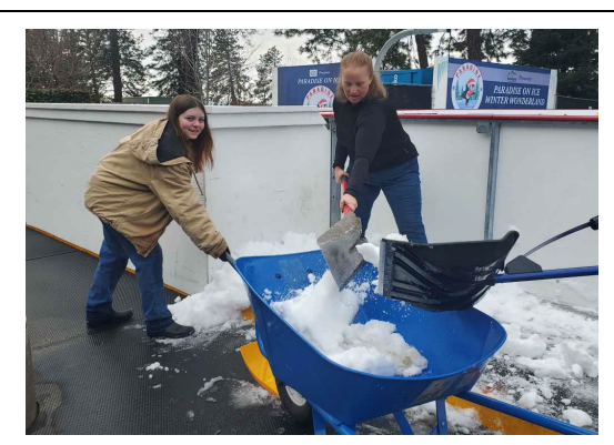
Figure 1. Staff working together to clear snow after a two-day snowstorm.