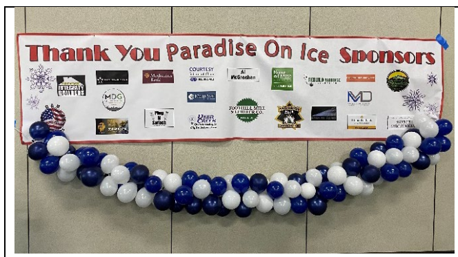
Figure 7 Sponsor Appreciation Party