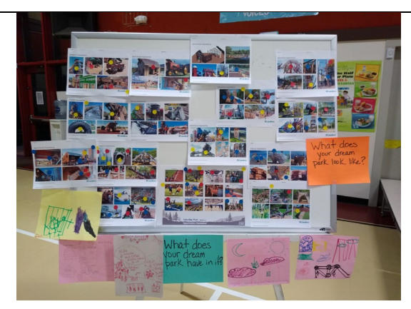
Figure 1. Kids in Magalia picked their favorite park amenities, playground design, and draw their dream park.