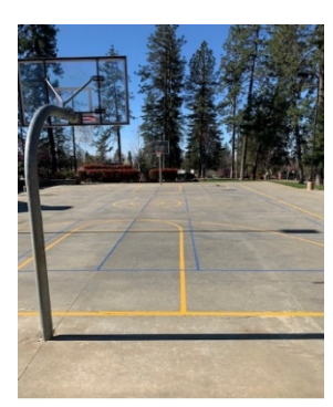
Figure 2 & 3: Here is a worker making improvements to the lines at TARC. Since the take down of the ice rink, the lines disappeared. Now, we have clean, fresh lines for basketball, and pickleball courts. Let the games begin!