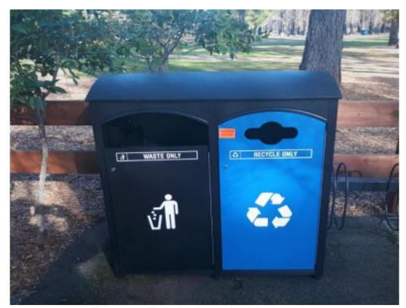
Figure 1: The sideload double container

In November, staff began working with grant writer Jennifer Arbuckle who had previous success with this grant program for California Vocations. Jennifer is helping the District to draft a proposal for the Cal Recycle Beverage Recycling Grant to be awarded in 2021. If funded, the grant would pay for the purchase and installation of 60 permanent sideload double outdoor containers (One side CRV Containers Only; one side Landfill Only). The number of containers for each park will be determined by park size and annual use data. Staff are seeking Board approval of Resolution #20-12-1-491, which authorizes the District Manager to proceed with the Cal Recycle Beverage Container Recycling Grant.