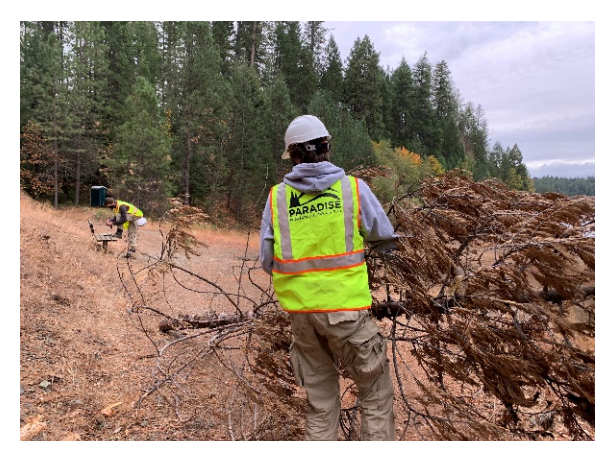
Figure 4. AmeriCorps (Green8) removing heavy fuel loads (dead/burnt trees) off trail.