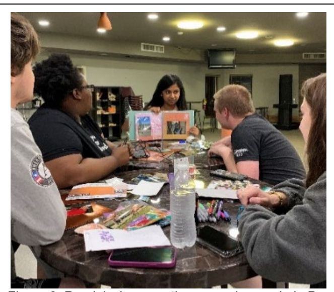
Figure 6. Reminiscing over the memories made in Paradise.