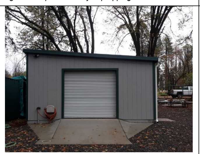
Figure 3: Shed at Bille Park.