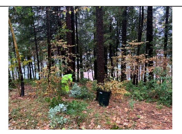
Figure 2. AmeriCorps (Green8) helping with fuel reduction and thinning.