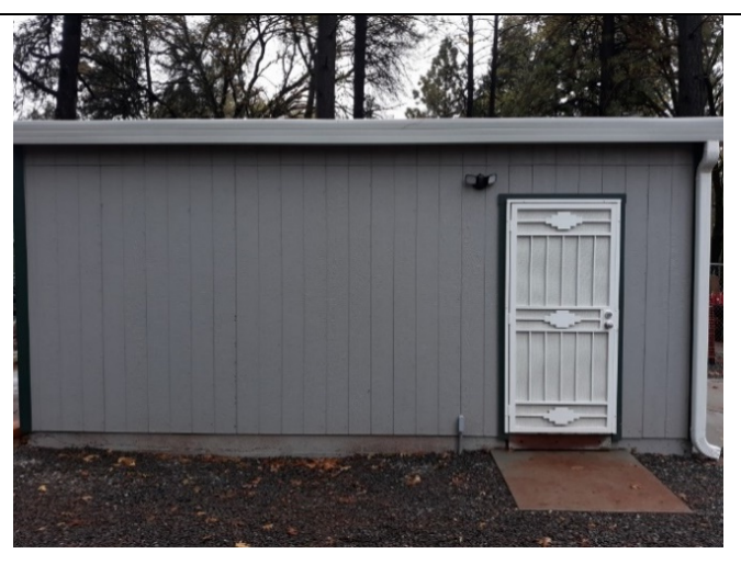
Figure 4: Bille Shed Entrance.