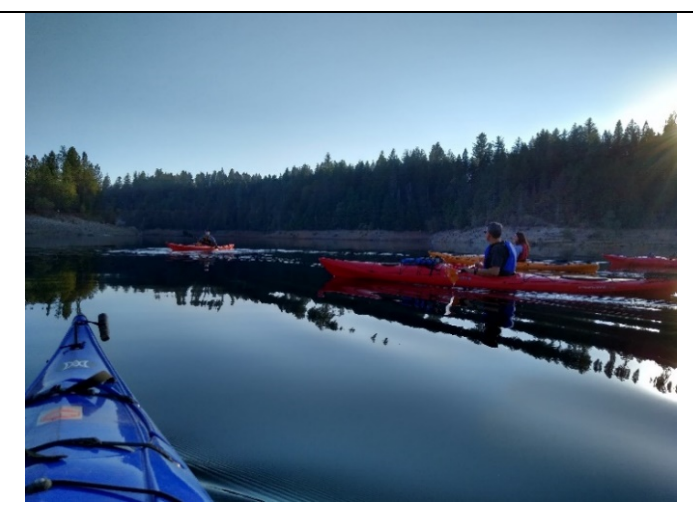
Figure 2: Staff on the water at sunset.