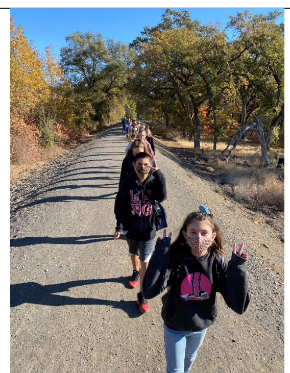
Figure 12. Achieve Charter School 7<sup>th</sup> Grade in single file, socially distanced hiking formation.