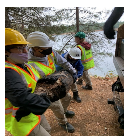
Figure 3. AmeriCorps (Green8) removing heavy fuel loads off trail.