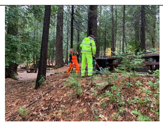
Figure 1. AmeriCorps (Green8) helping with landscaping.