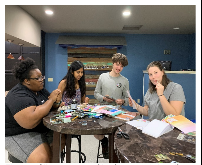
Figure 5. Silver 3 team crafting for appreciation gift.