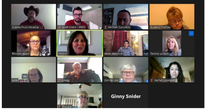
Figure 13. Association of Realtors – ReDiscover the Ridge Presentation.