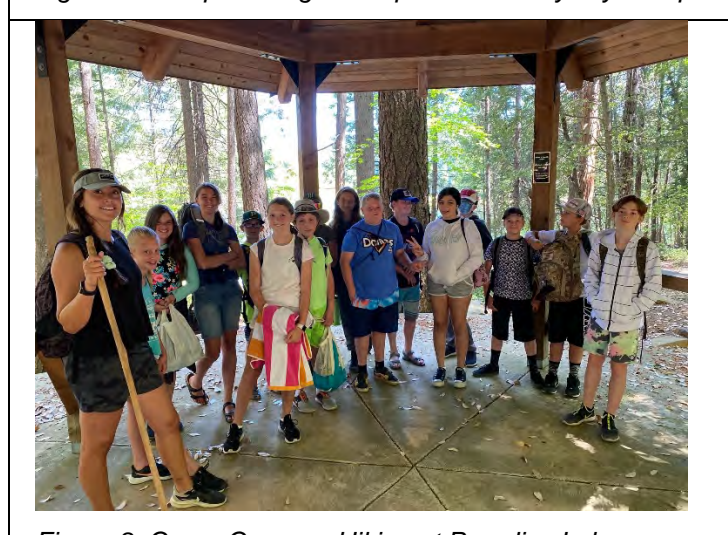
Figure 8. Camp Courage Hiking at Paradise Lake