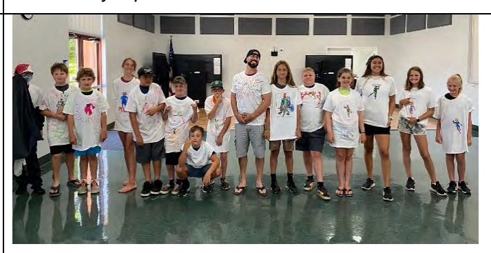
Figure 6. Camp Courage Superhero Shirt Day