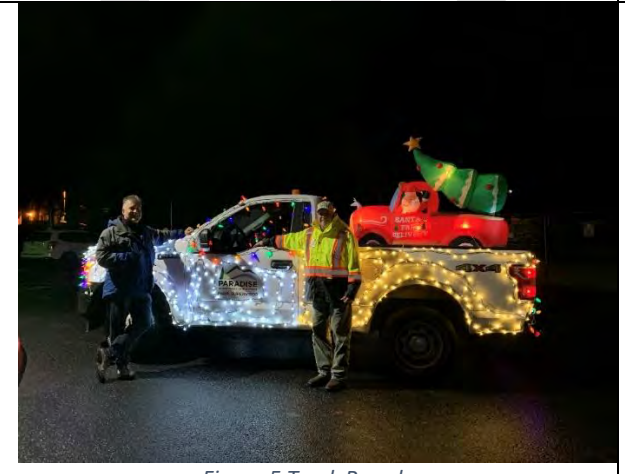
Figure 5 Truck Parade