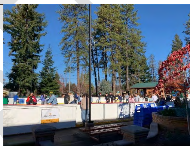
Figure 4 Skaters enjoying sun at the rink