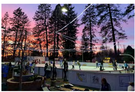
Figure 2 Sunset at the rink