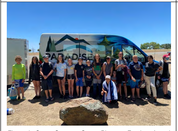
Figure 3. Camp Courage Group Photo at Forebay Aquatic Center