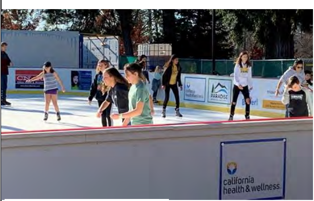
Figure 1 Sponsor Skate Day