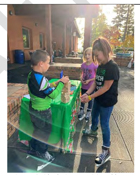
Figure 10 Kids playing at activity table