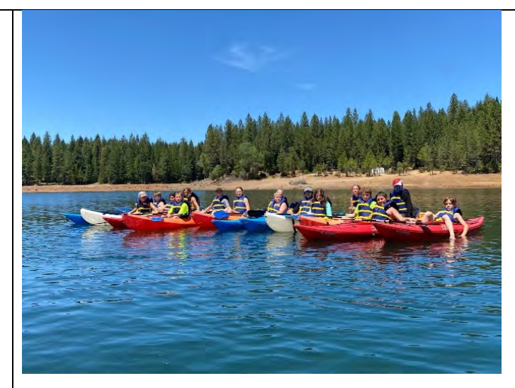
Figure 9. Camp Courage Kayaking at Paradise Lake