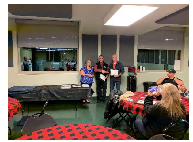
Figure 7 Sponsor appreciation party