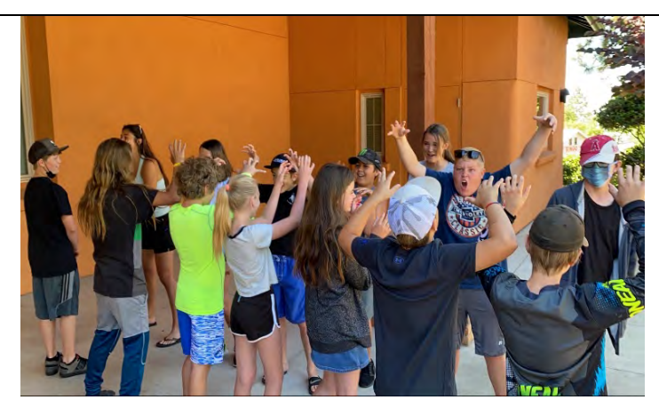
Figure 5. Camp Courage Morning Warmup