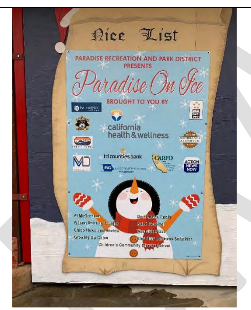
Figure 9 The Nice list