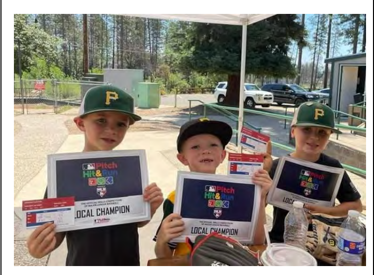
Figure 1. Pitch, Hit, and Run event at the Moore Road Ball Park.