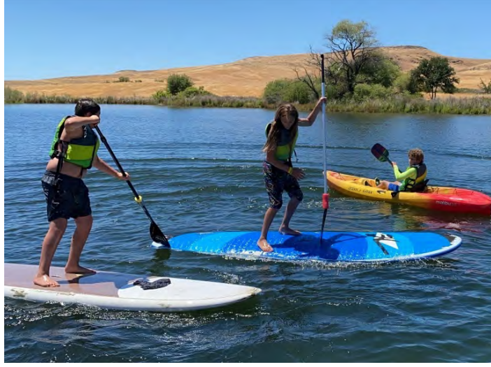
Figure 4. Camp Courage Participants Enjoying the Water at the Forebay Aquatic Center