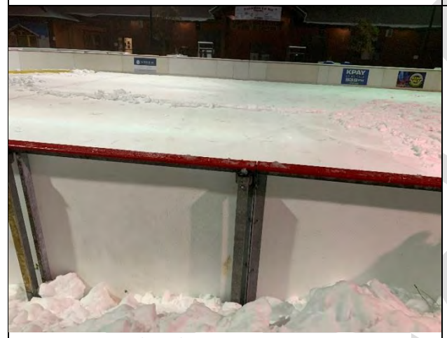
Figure 3 Snow on the rink