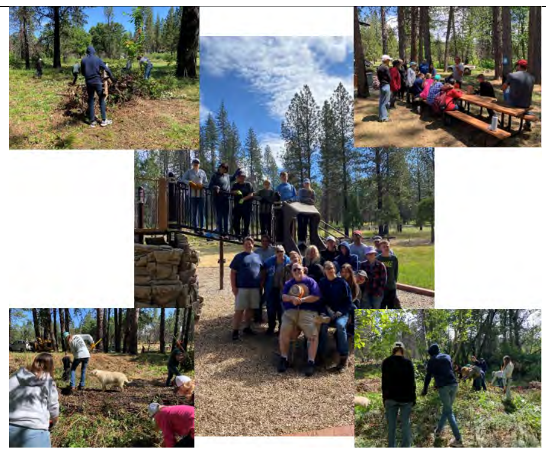
Figure 10. VROC crew - creek clean up at Crain Park.