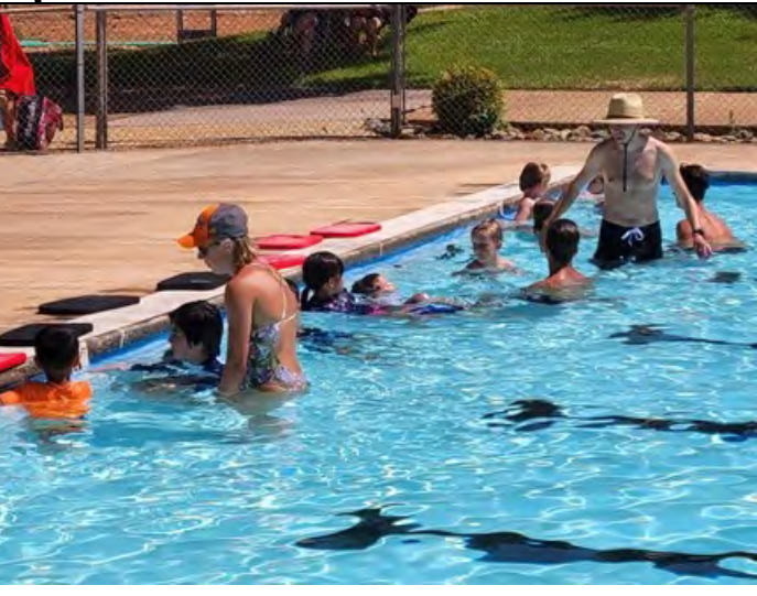
Figure 2. Swimming lessons at the Paradise Pool.