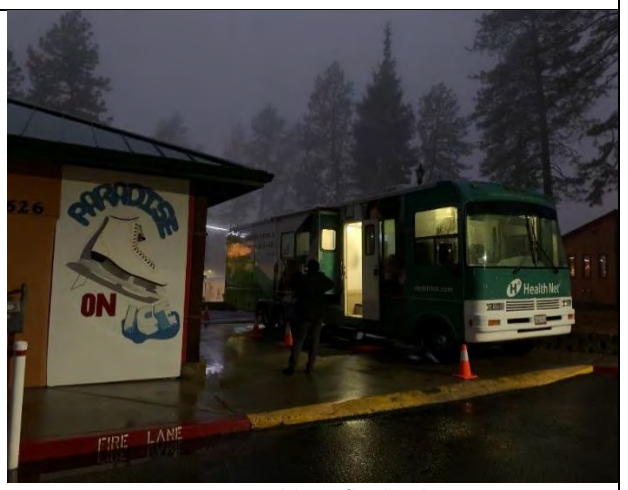
Figure 6 Healthnet flu shot bus