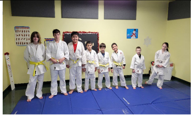
Figure 10. Kids participating in Judo at the TARC.