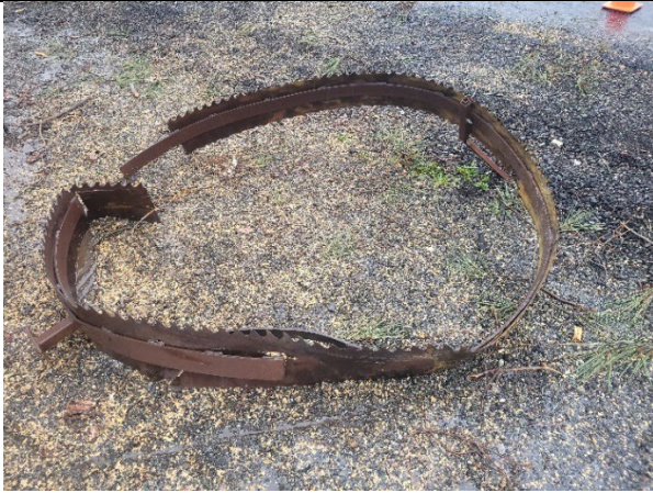
Figure 5. The Paradise Welcome Sign halo. It is being stored at the maintenance building until it can be mended.