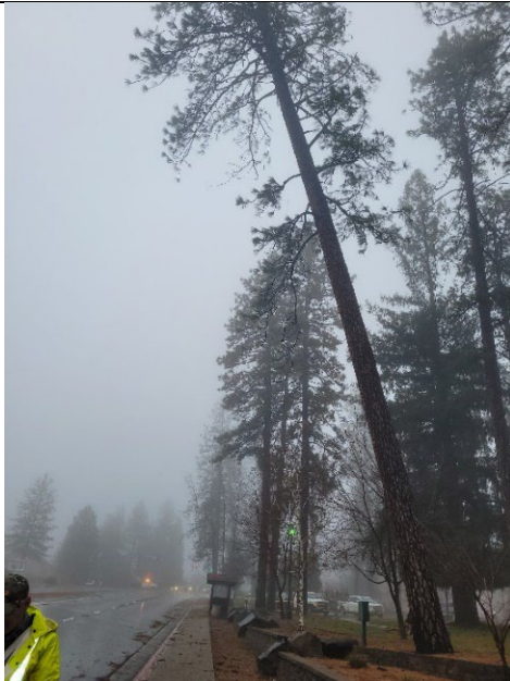
Figure 7. One of the large trees at the TARC had some uprooting and was taken out after one of the storms.