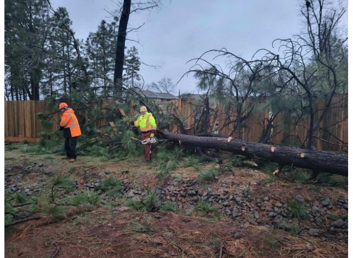
Figure 2. PRPD crew working on cutting and clearing the tree that fell at Bille Park. The fence it hit has also been repaired.