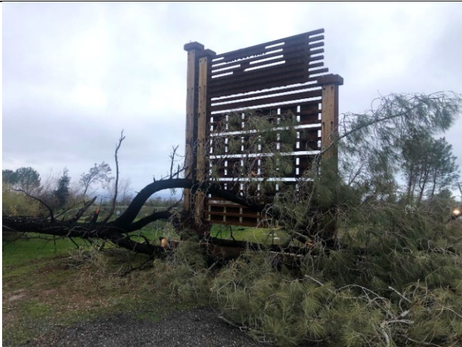
Figure 3. A tree fell alongside the Paradise Welcome Sign and took out the halo.