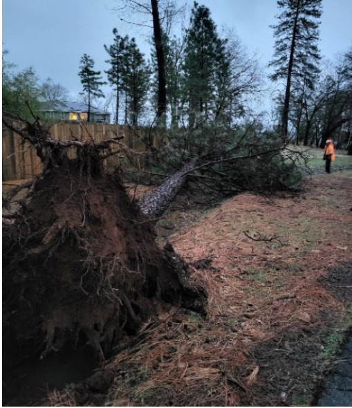
Figure 1. A tree in Bille Park fell and hit a neighboring fence during one of the storm days.