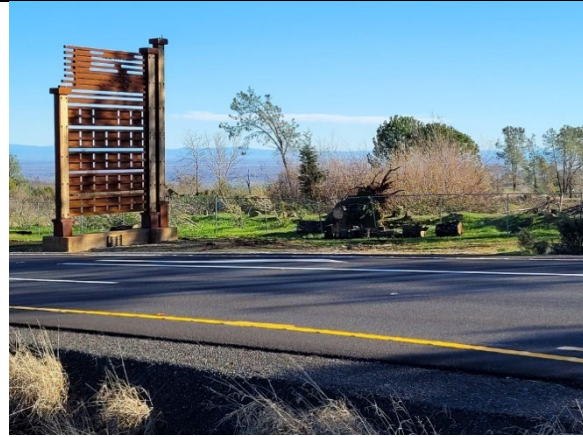
Figure 6. The Paradise Welcome Sign all cleaned up after the fallen tree.