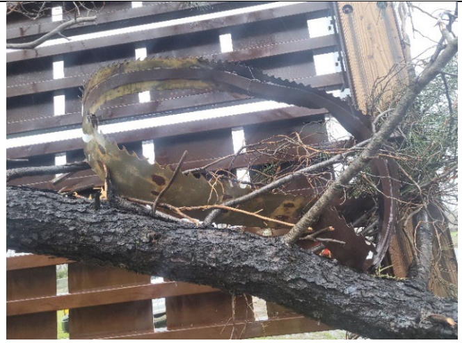
Figure 4. The tree and halo lodged into Paradise Welcome Sign.